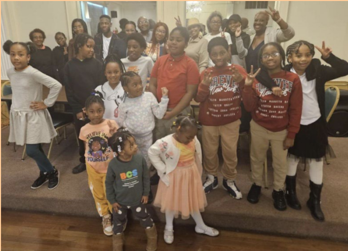
Thanksgiving "Potluck Fellowship"