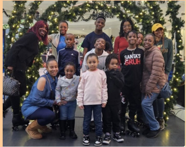
Holiday Celebration @ RISE/NY